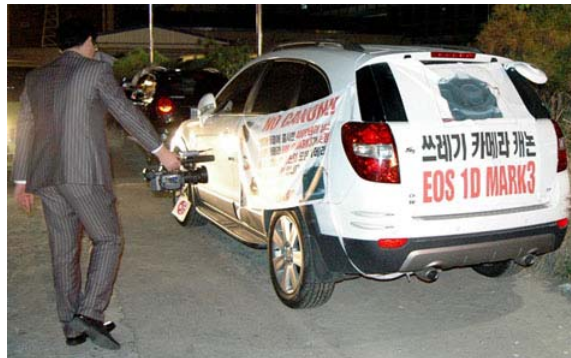
Image shown: A car belonging to a frustrated Korean photographer. The text on those banners translates to: "Camera that is a piece of trash Canon EOS 1D Mark 3"